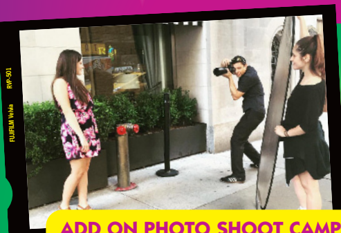
Photo Shoot Camp

ADD ON PHOTO SHOOT CAMP TO YOUR CAMP SESSION!