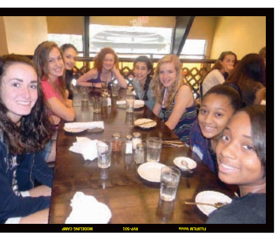
Modeling Camp at lunch.

All girls should eat a healthy, well-balanced diet and maintain a regular exercise routine. Campers learn about health and nutrition and have their own personal yoga session with a Modeling Camp Health and Fitness Instructor.