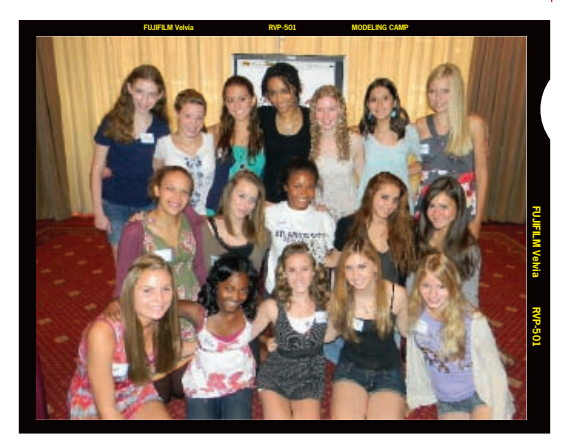
Modeling Camp campers meet with Ashley Howard from America's Next Top Model!

VISIT WITH AMERICA'S NEXT TOP MODEL ALUMNI