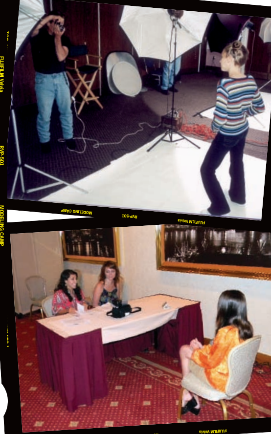
Modeling Camp girls being interviewed by MTV this summer.