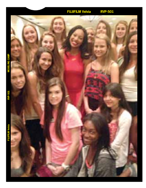
Modeling Camp campers with Bianca Golden from 'America's Next Top Model'!

VISIT WITH 'AMERICA'S NEXT TOP MODEL' ALUMNI